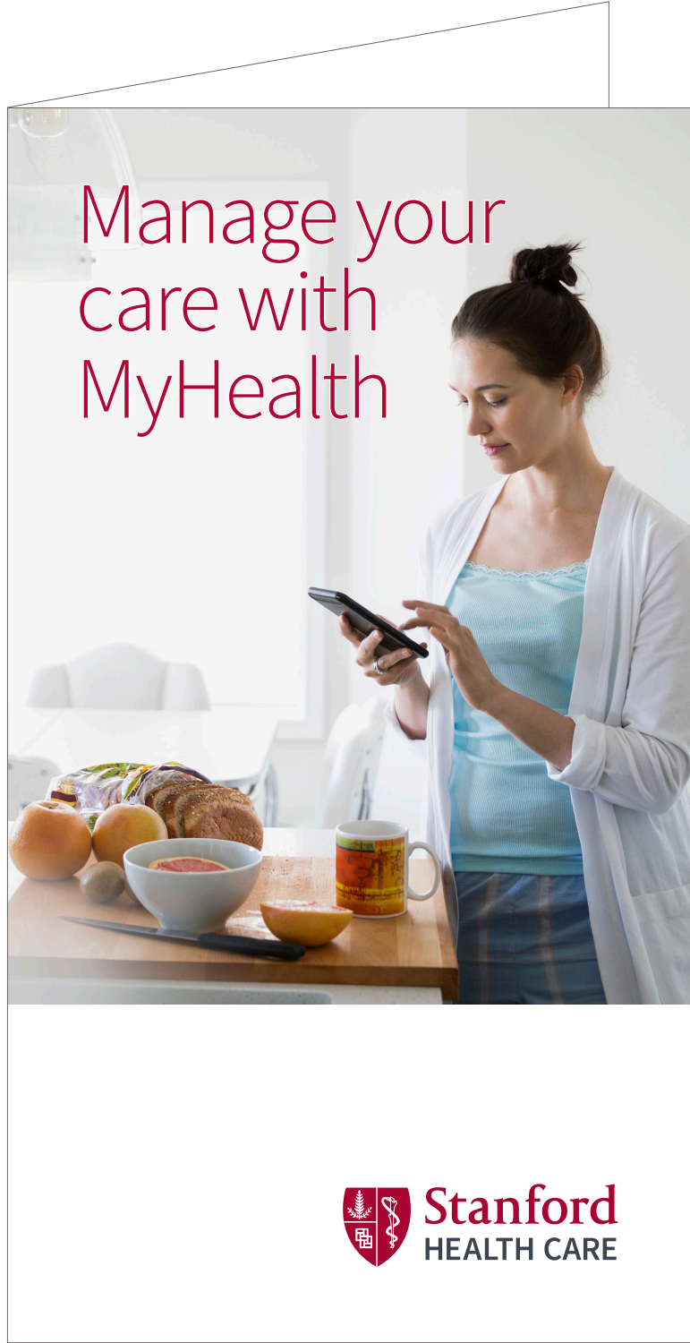
5"width x 9"height